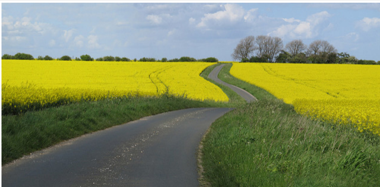
The Road to Burnham